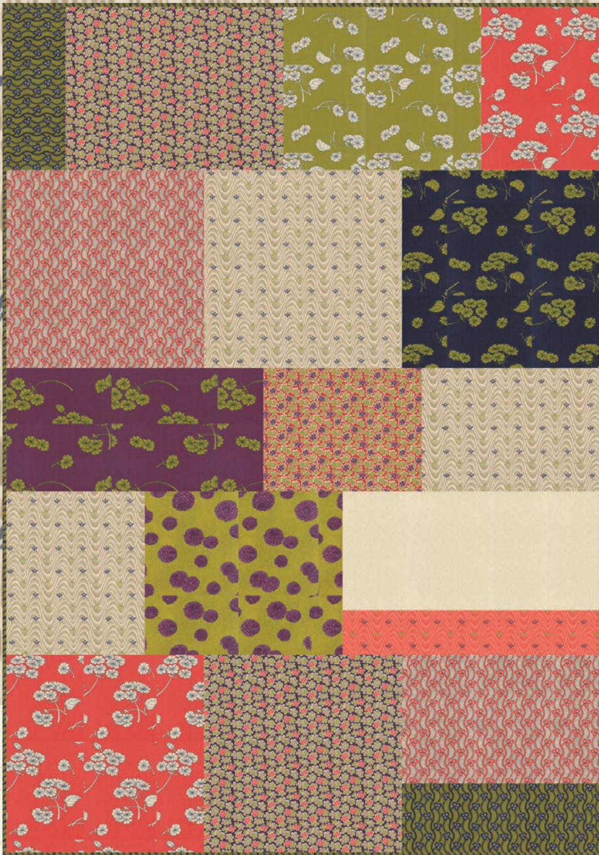
Kantha Quilt is 60" x 85½"