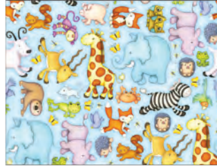
6303-11 Blue Tossed Animals