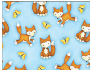
6299-11 Blue Fox