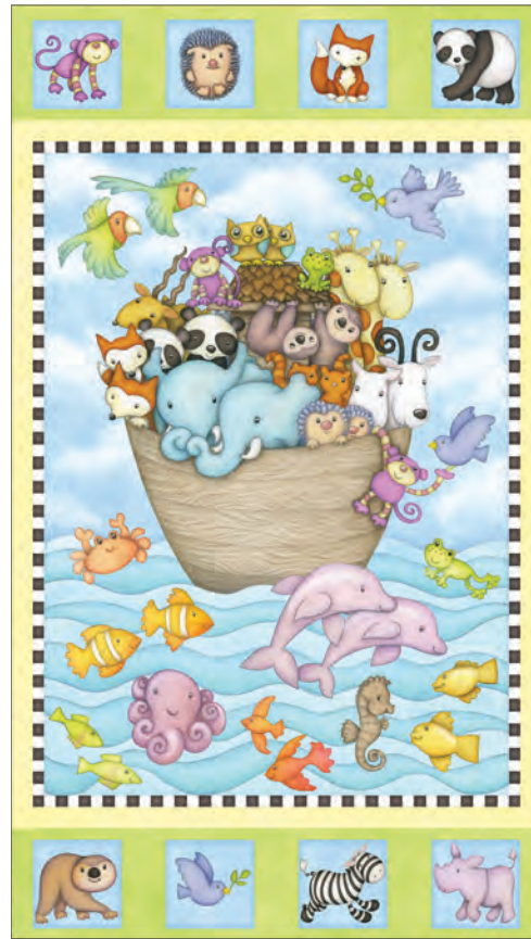
6297P-46 Multi Panel