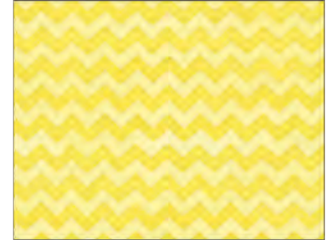
6302-44 Yellow Chevron