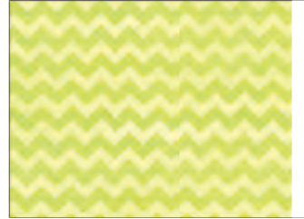
6302-66 Green Chevron