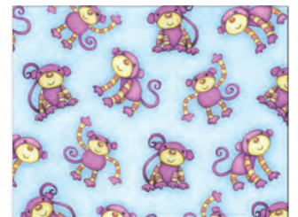
6300-11 Blue Monkey