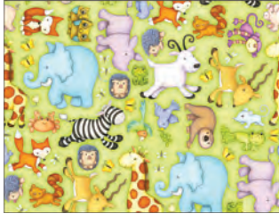
6303-66 Green Tossed Animals