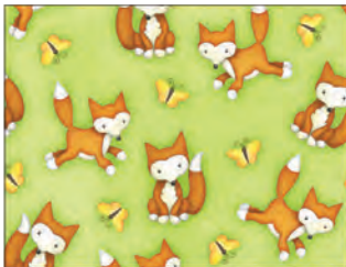
6299-66 Green Fox