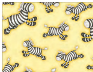
6298-44 Yellow Zebras