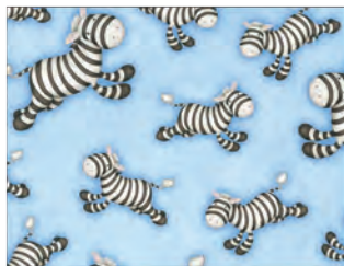
6298-11 Blue Zebras