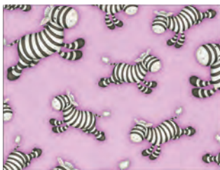
6298-55 Purple Zebras