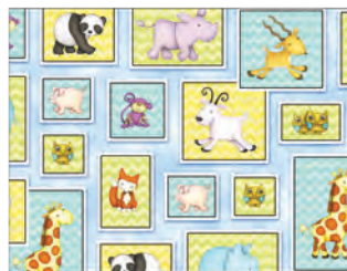
6301-11 Multi Animal Patch