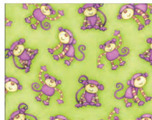
6300-66 Green Monkey