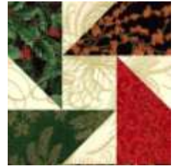
Example A Round 1